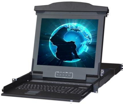
↑ (USB Port for device access)